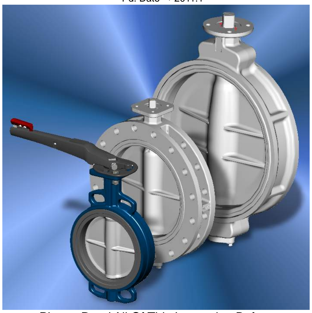
Please Read All Of This Instruction Before Installing Your VF-730/733/737 Valve