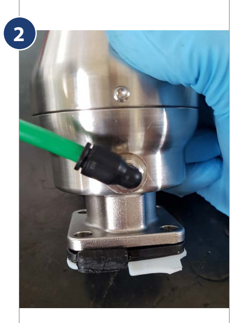
Remove the fasteners and the valve actuator.

IMPORTANT: Ensure that excess pressure has vented prior to fastening removal.