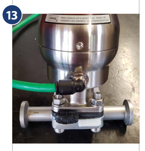
Remove air pressure from Actuator (only applicable to ' NC ' actuators)

This determines that even compression has been applied to all fastenings.